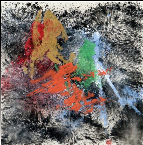
28" x 28" framed